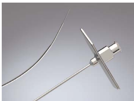
transeptal needle for transseptal left heart access from Cook

The workshop day will kick off with a hands-on workshop on Transseptal Access Techniques presented by Cook Medical from 8:45 to 10:45 am.