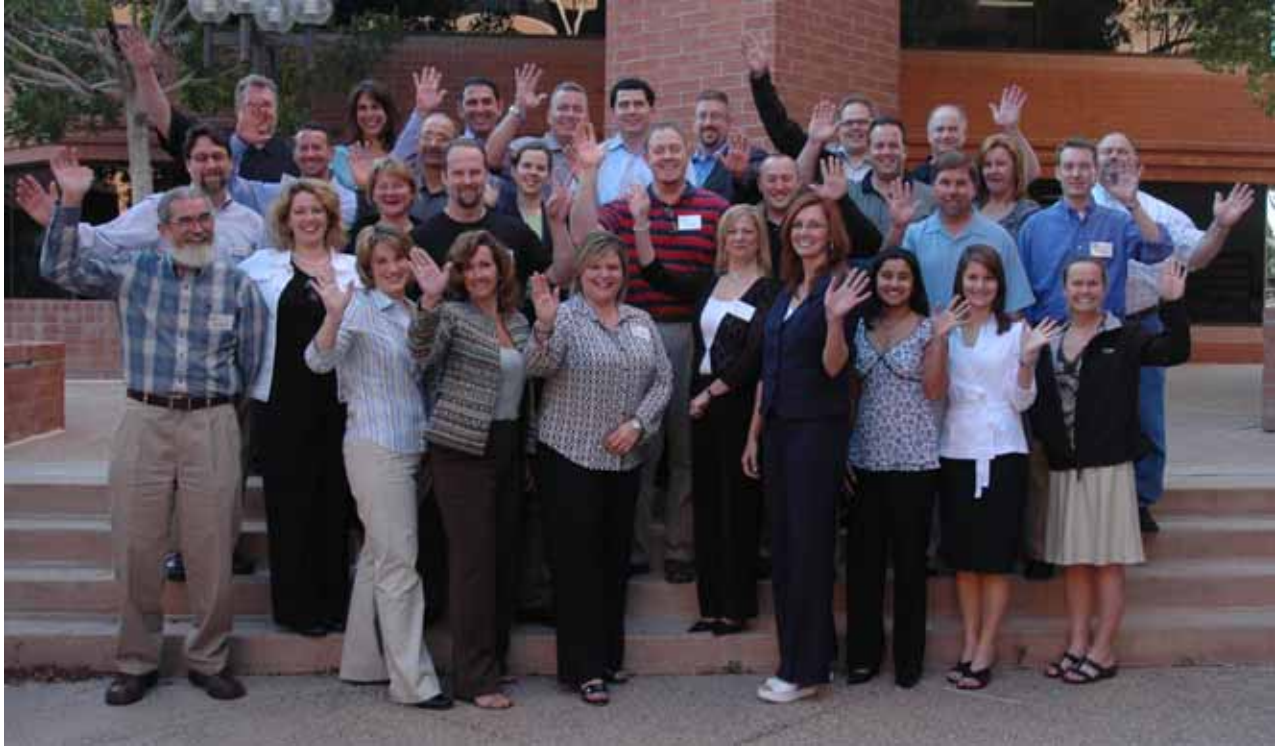
The W.L. Gore & Associates Stroke and Cardiac Intervention Sales team is ready to serve your needs.

W ith over 23 million implants to date, Gore Medical Products have been saving and improving the quality of lives worldwide for over 30 years.